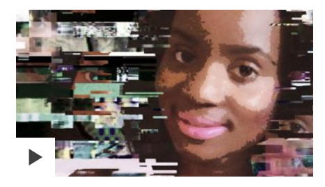
Church pastor a career con artist