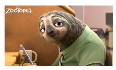
How Americans are coping with the loooong wait