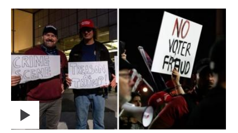
'Stop the count' or 'count the votes'?